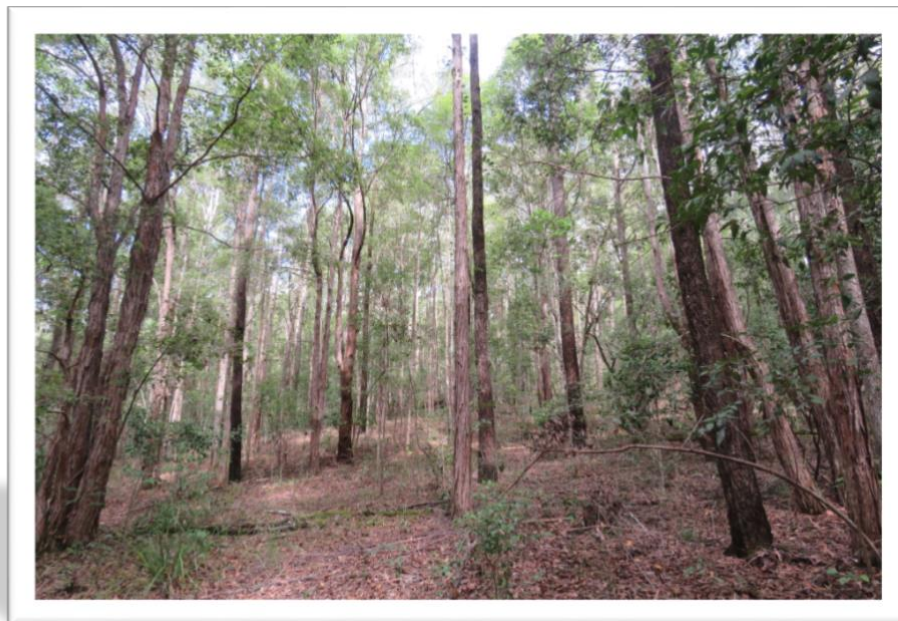
Stage 3: The effects of using splatter gun technology on Lantana. The under story is able to regenerate, the shade keeps the lantana at bay and the system continues to heal.