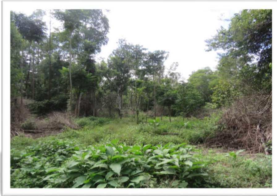
Stage 2: Treated forest. Splatter gun used to effect. Lantana is killed and the forest begins to heal.

The Bell miners (sometimes referred to as Bellbirds) are a native honeyeater with a very distinctive “bell like” call. They live in well organised colonies and actively chase out any birds they see as a threat. In eucalypt forests heavily infested by lantana there are often large colonies of Bell miners who nest in the lantana as well as feed on the lerp (from the psyllid insects) Where these over abundant populations of Bell miners occur other birds are driven out and psyllid numbers soar leading to the development of BMAD. Without intervention the death of the forest is inevitable.