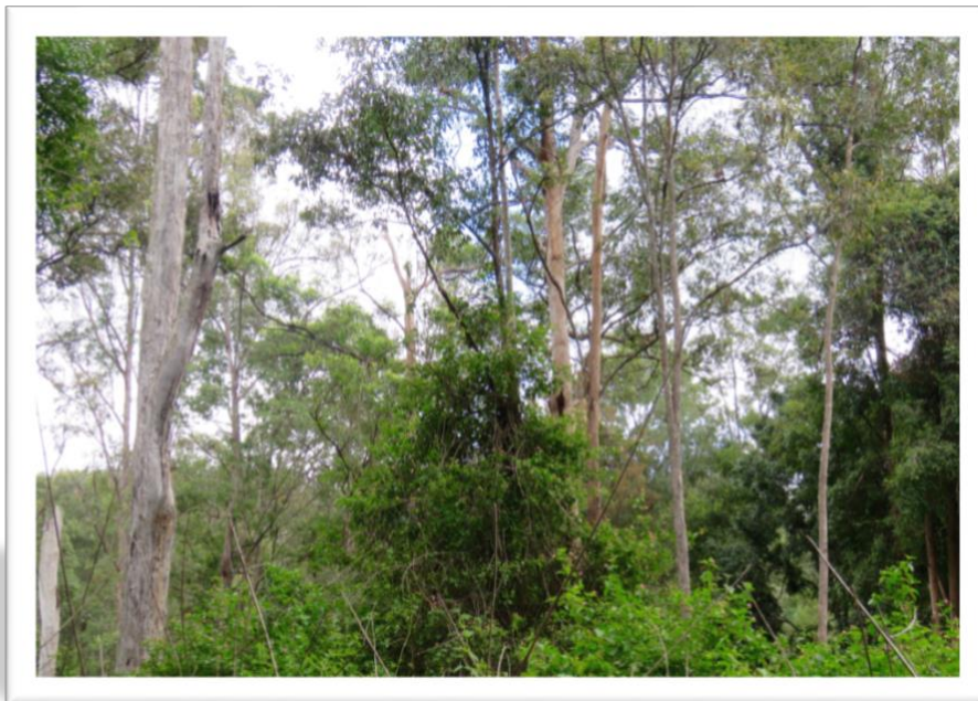
Stage 1: Untreated Forest. Evidence of die back

BMAD is a severe form of tree stress caused by insect attack that is having a significant impact in NSW eucalypt forests and is spreading at an alarming rate impacting on biodiversity and the productive capacity of coastal eucalypt forests.